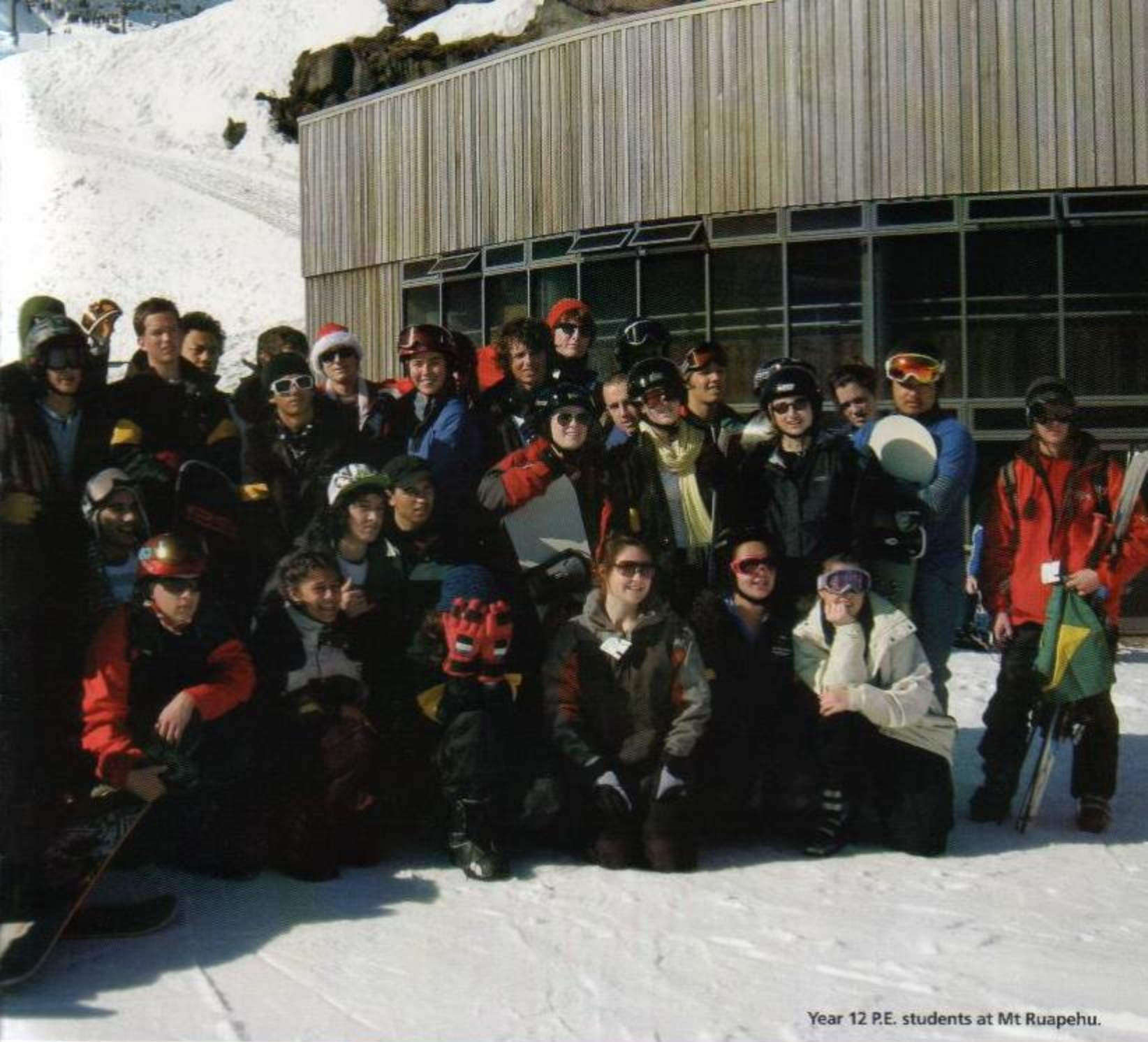
Year 12 P.E. students at Mt Ruapehu.